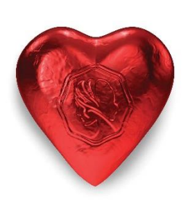
RED MILK CHOCOLATE