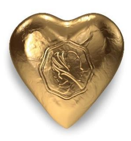
GOLD MILK CHOCOLATE