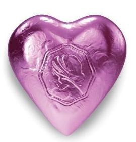
PINK STRAWBERRY TRUFFLE